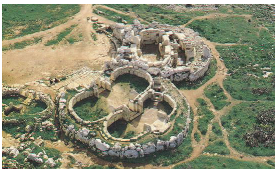
Aerial picture of Mnajdra

This guided tour will take all participants for a walk through Malta's 8,000 years of history. The visit will start first with the marvellous complex of Megalithic temples at Hagar Qim//Mnajdra located on the cliffs overlooking the Mediterranean Sea on the south west coast of Malta. These are some of the oldest standing structures in the world, dating back 5,000/6,000 years before the Christian era. Then, back to the coach to the centre of Malta, to visit the Domus Romana at Rabat, a beautifully restored Roman country residence. From Rabat, we will go for lunch at the Radisson Hotel, which overlooks the Golden Sands Bay, one of the four sandy beaches in the North West coast of Malta. After lunch, the tour continues to Mdina, the old capital of Malta. Mdina, known locally as the silent city, was first built around 4,000 years ago. During the Roman period the city was called Melita but this was changed to Medina during the Arab period. When the Arabs took over the city, they reduced its size and surrounded the city by massive fortifications. It contains several palaces, churches and other buildings all dating back to the middle ages and beyond. Mdina is a unique example of a fortified hill-top medieval city and has recently been restored to its past glory. After the visit to Mdina, the coach will be leaving at 16.30 hours and be back to the hotels at 17.00 hours.