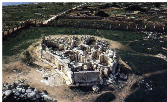
Aerial picture of Hagar Qim

We look forward to warmly welcome you in September 2011 in Malta!